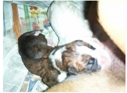
Pippa minutes old December 8, 2010