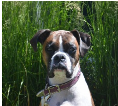
Pippa, 4 1/2, posing for consult 6/2015