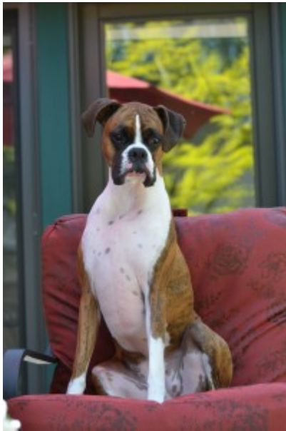
Pippa 2 1/2