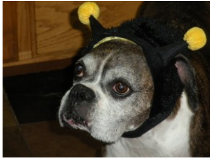
Helen: I'm a bee! 2009