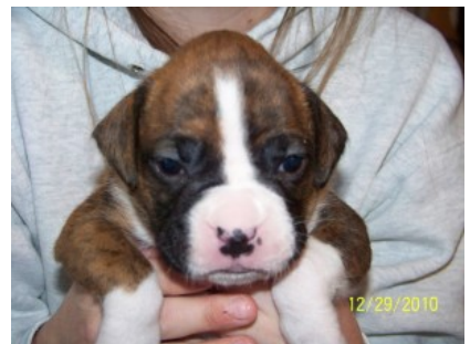
Pippa three weeks