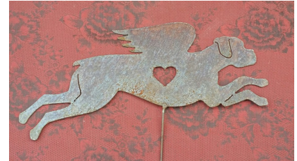
Made it home