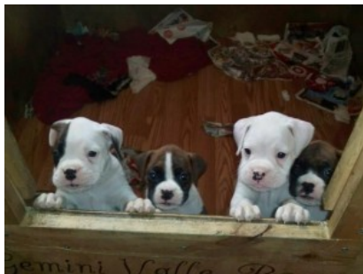
Between the boys, cutie sister too